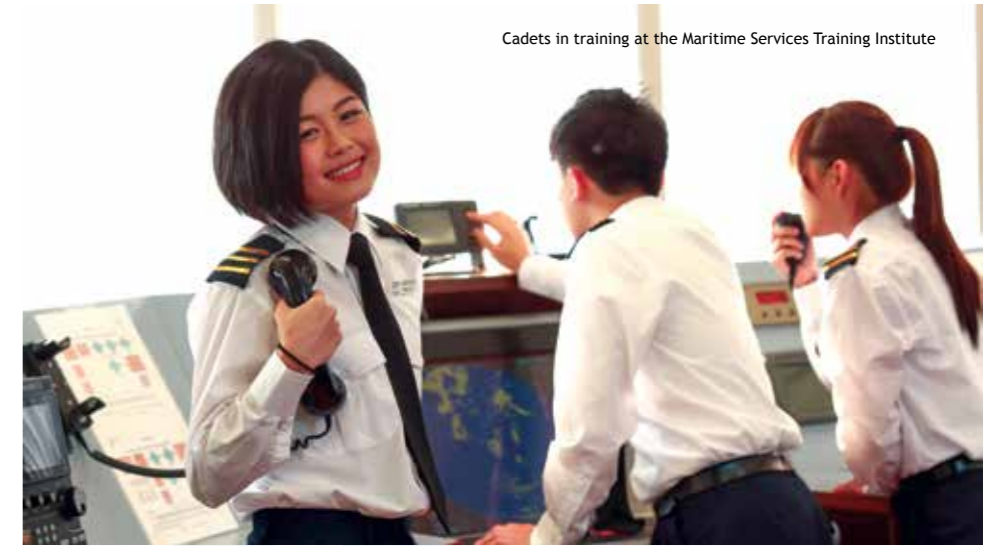
Cadets in training at the Maritime Services Training Institute

"I knew from an early age that a sea-going career would provide me with a good opportunity to travel the world and experience foreign cultures," he says.